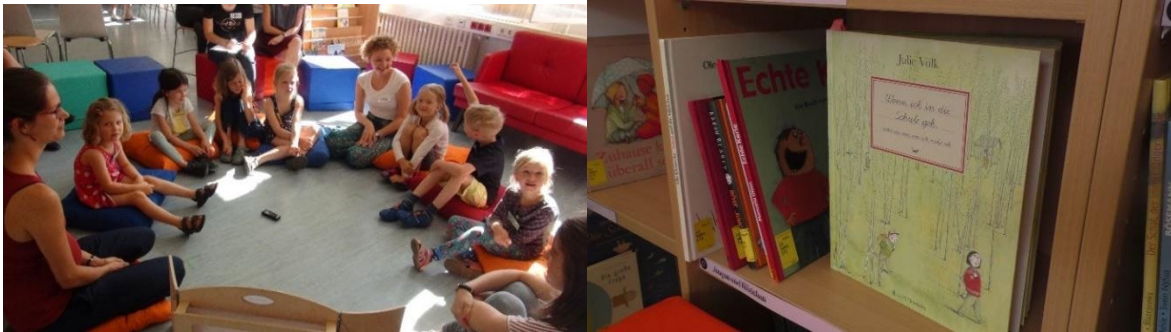
Figure 3. Playing the game “I see something you don’t see” as an introduction to the picturebook

prepared a seating circle on the floor with cushions, surrounded by colourful seating cubes. The student teachers chose a playful approach to start the conversation with the children and to introduce them to the picturebook (Figure 3).