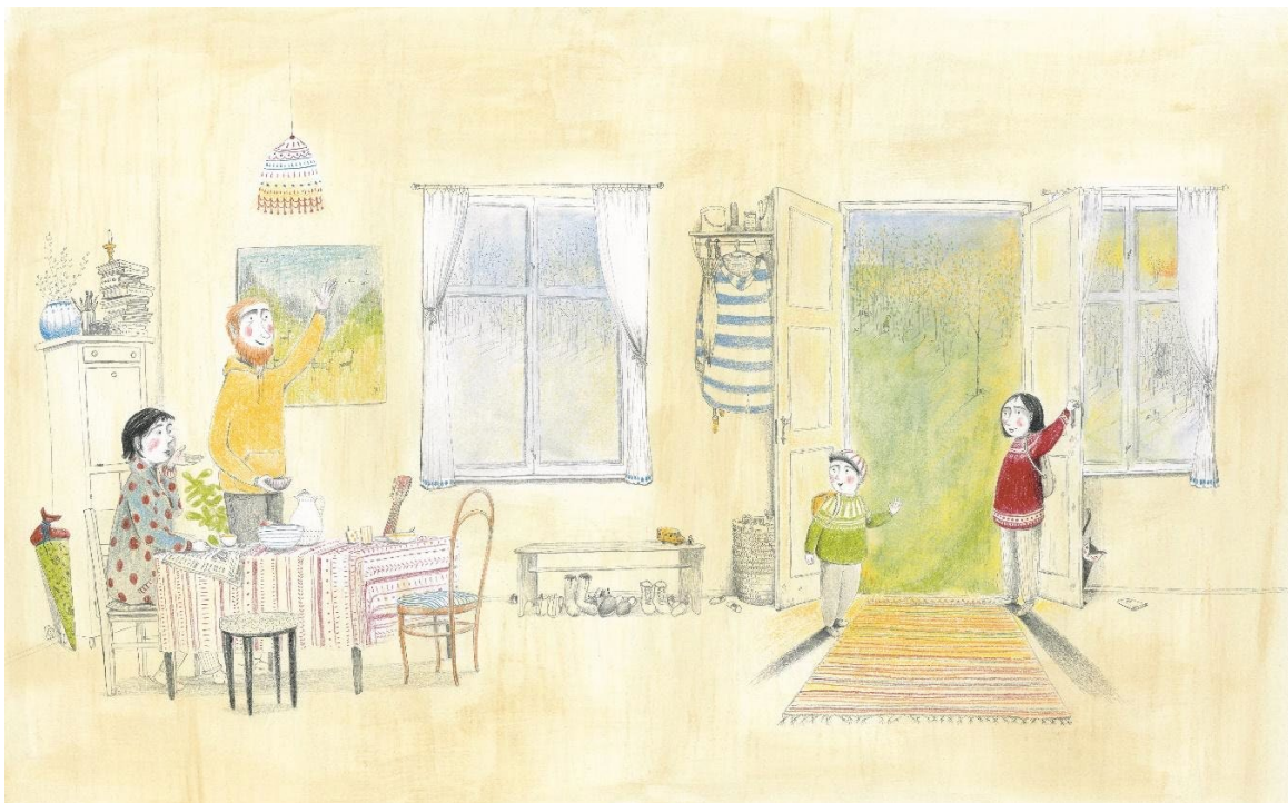
Figure. 8. © Julie Völk (illus.), from: Wenn ich in die Schule geh, siehst du was, was ich nicht seh , Gerstenberg Verlag

The student teachers pay special attention to the first double-page spread in the picturebook discussion with the children. It is this page that introduces the story, represents the starting point of the plot, and introduces the characters (Figure. 8).