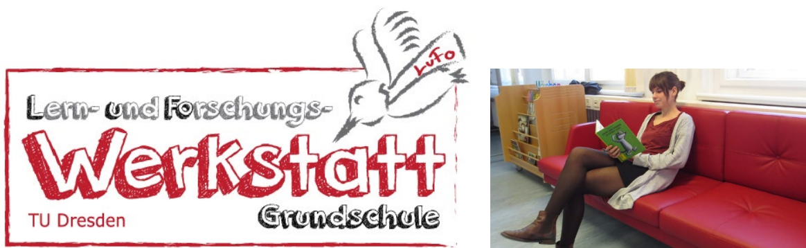
Figure. 1. Logo and interior view of the LuFo (Lern- und Forschungswerkstatt Grundschule)

The “Lern- und Forschungswerkstatt Grundschule” (LuFo) (Primary Education Research Lab) at the TU Dresden was created in 2013 and was developed and lead by this author in cooperation with other colleagues (Hoffmann et al., 2019, Figure. 1). The LuFo is conceived as a stimulating learning environment with diverse language and literature didactic materials and an extensive collection of contemporary children's literature, with a focus on picturebooks. These offer student teachers an insight into children's life worlds and open numerous storytelling, talking and writing opportunities with children. In this way, future teachers can build up a “story repertoire” (Dehn et al., 2014) during their studies, which they can draw on in their later teaching practice.