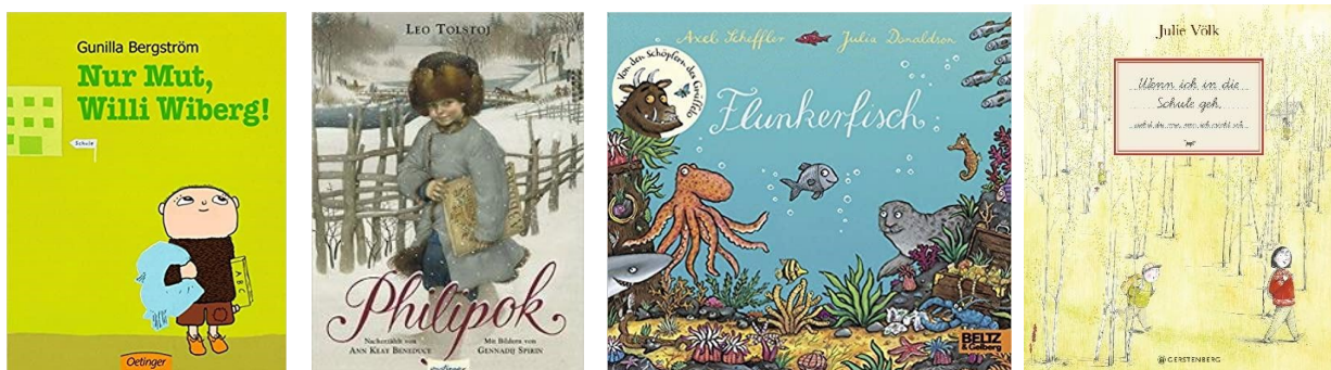
Figure 2. Covers of the picturebooks selected by the student teachers (Bergström, 1982; Tolstoj & Beneduce, 2000; Donaldson, 2007; Völk, 2018)

The student teachers formed four groups of five to eight student teachers and were asked to select one picturebook per group. The four books chosen were (Figure 2): Nur Mut, Willi Wiberg (Bergström, 1982), Philipok (Tolstoj & Beneduce, 2000), Flunkerfisch (Donaldson, 2007) and Wenn ich in die Schule geh, siehst du was, was ich nicht seh (Völk, 2018).