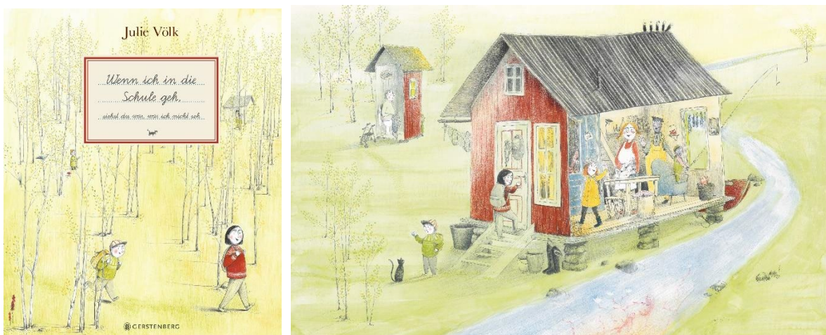
Figure. 6. © Julie Völk (illus.), from: Wenn ich in die Schule geh, siehst du was, was ich nicht seh , Gerstenberg Verlag

With the selection of the picturebook (Figure. 6), central decisions have already been made for the reading aloud workshops. How do student teachers choose their picturebook and how do they deal with the picturebook's ambiguity and openness to interpretation?