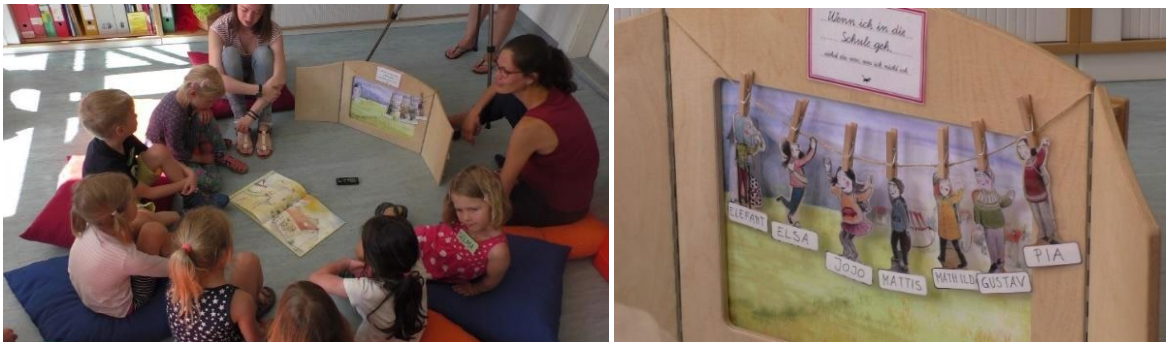
Figure. 7. Talking about the picturebook story

In their didactic arrangement, the student teachers assign particular importance to spatial design (Figure. 7).