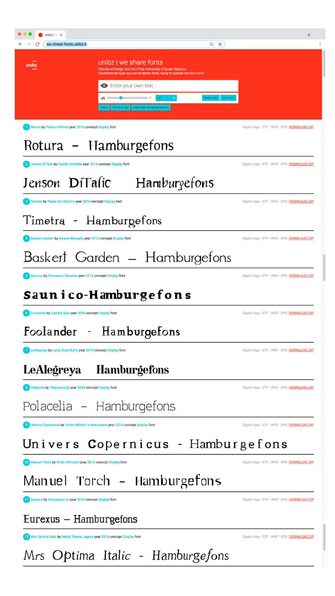
Figure 2. we-share-fonts.unibz.it - user interface | community website