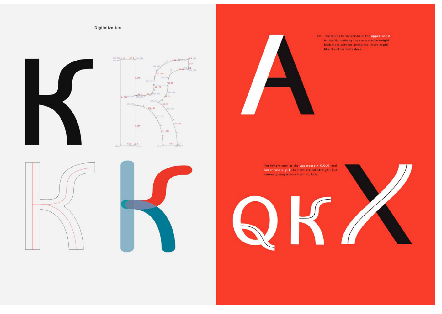
Figure 1. Example of Typeface Specimen

The research fosters the ground how to design a professional Typefaces or Font with Adobe Illustrator. In the scientific community, Type Design is done with highly specialised software and sophisticated methodologies. Finding new ways in Type Design with the Industry Standard Software Adobe Illustrator, will access the Discipline of Type Design to a much wider audience.