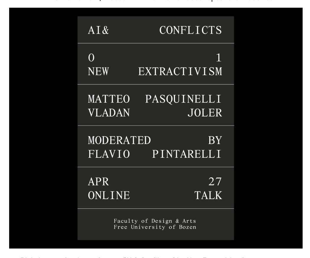
Digital poster for the conference "AI & Conflicts. 01 – New Extractivism".