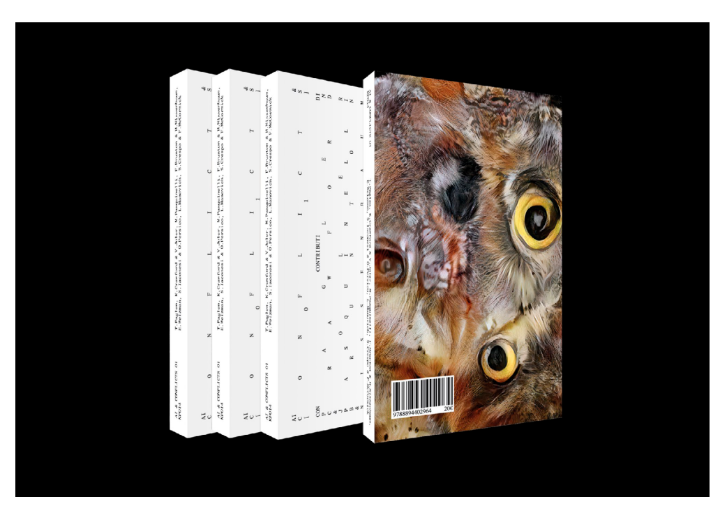
The book "AI & Conflcits. Volume 1"