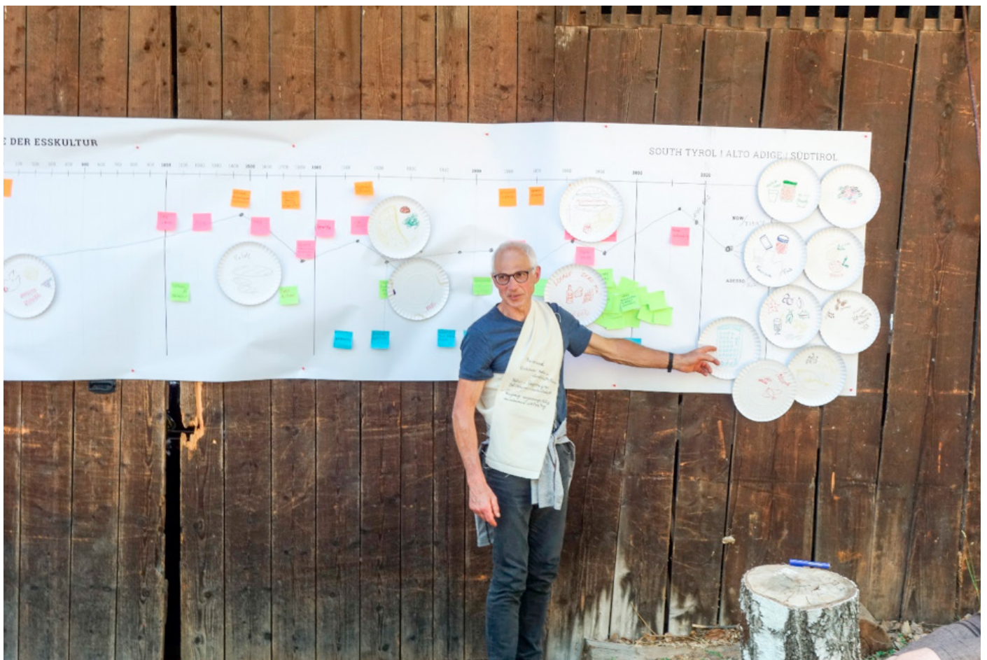
Figure 4. A farmer from Wipptal describes his vision for near future foods in the “Food by describing a typical meal he drew on a paper plate. Aspmayrhof, Val Sarrentino, June 2018.

The primary objective of What Could A Farm Be? is to explore agro-socio-ecological opportunities for small farms[3] in Europe through inter-disciplinary design, art and social practices. The aim is to bring together the stakeholders to explore and experiment with potential new experiences, services or products that go beyond conventional thinking in farming and rural development. Early initiatives include several workshops (see Diversescape, https://diversescape.wordpress.com/ ) and creating a platform and network (muu-baa http://www.muu-baa.org ) for explorations, exchanging ideas and developing collaborative on-farm projects.