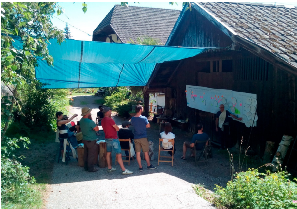
Figure 2. A workshop developing a collective "Food Timeline", past, present, future, for South Tyrol. Aspmayrhof, Val Sarrentino, June 2018.