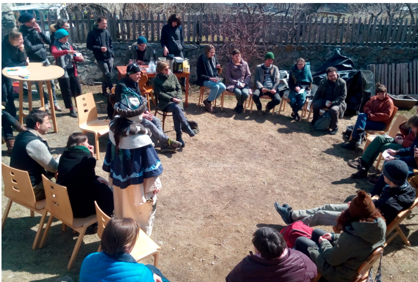
Figure 3. A discussion about what is, and what could be shared, in farming communities in South Tyrol. Sockerhof, Malles Venosta, South Tyrol.

This is framed within the Common Agricultural Policy for environmentally and socially sustainable farming, with special reference to 'sustain viable rural communities with diverse economies' and 'keep(ing) the rural economy alive'. [1]