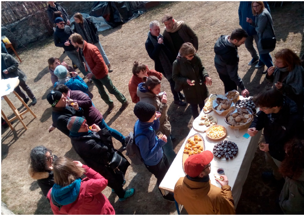
Figure 1. Participants at the workshop on Open Farm(-ing) enjoying locally prepared food at Sockerhof, Malles Venosta, South Tyrol as part of the Hier und Da festival, March 2018.